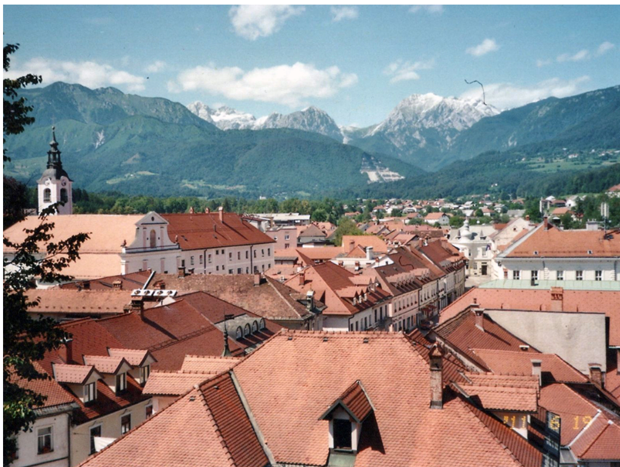
Photo below: View over northern part of Kamnik from Mali grad Hill.

Learn more about Kamnik by visiting: https://www.slovenia.info/en/places-to-go/regions/ljubljana-central-slovenia/kamnik .