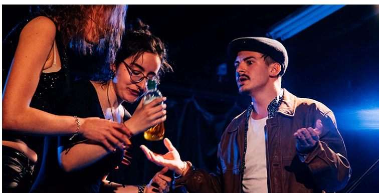
Bottom right: Exhibition opening evening