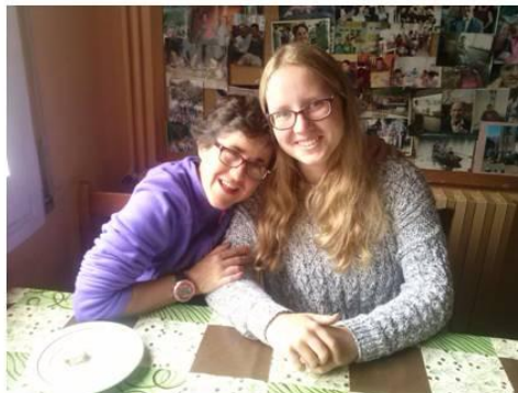
COMUNITAT ELS AVETS - Moià