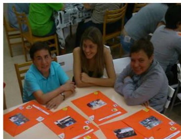
COMUNITAT ELS AVETS - Moià