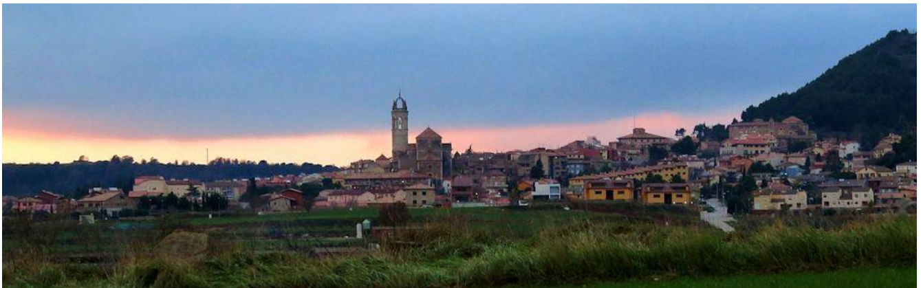
Sunset in Moià

There is public Transport to Barcelona and other cities (Manresa – Vic) by bus.