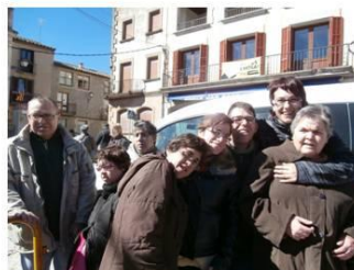
COMUNITAT ELS AVETS - Moià